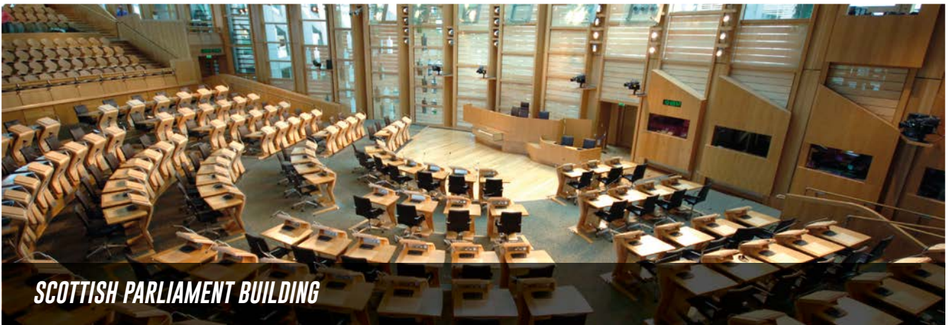
SCOTTISH PARLIAMENT BUILDING